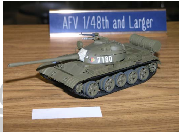
Dave Milne / T-55 Main Battle Tank