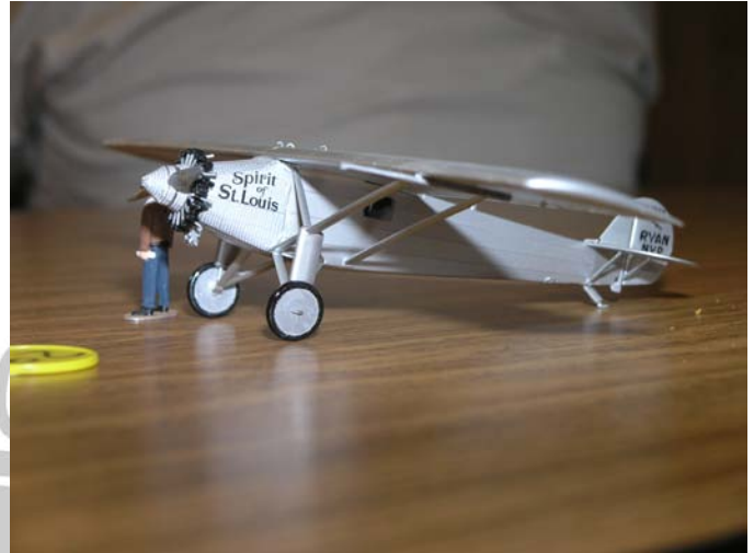
1 st place – Tim Hosek / Spirit of St. Louis