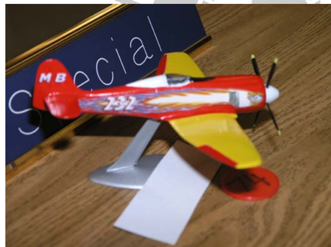
1 st place – Tim Hosek / September Fury