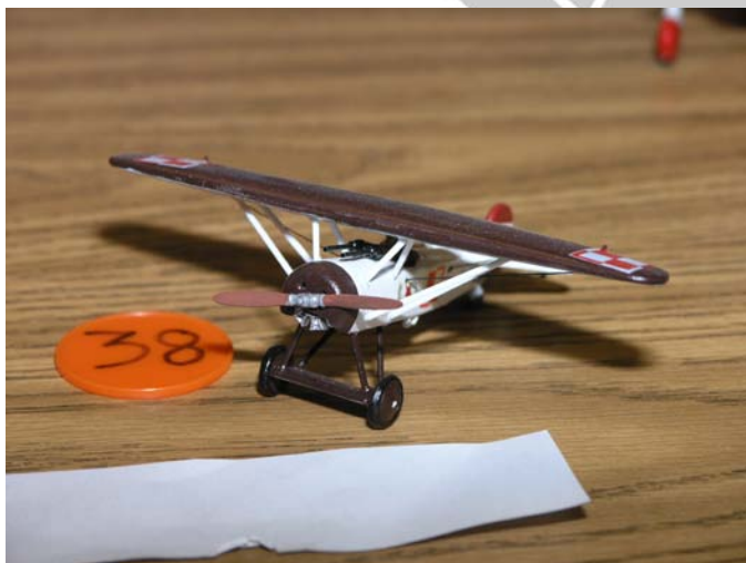
1 st place – Dave Milne / Fokker D.8